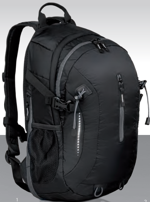
1. OUTDOOR BACKPACK FLASH L (LPN501) 2. OUTDOOR BACKPACK FLASH M (LPN525)