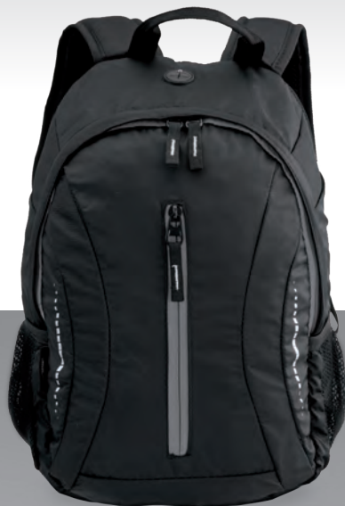
SPORT BACKPACK FLASH S (LPN550)

Sport backpack Flash S has a headphone output, breathable back, reflective elements, side mesh pockets and 1 main pocket with an internal organiser, as well as 1 small zipped pocket on the front of the backpack. Perfect for short trips.