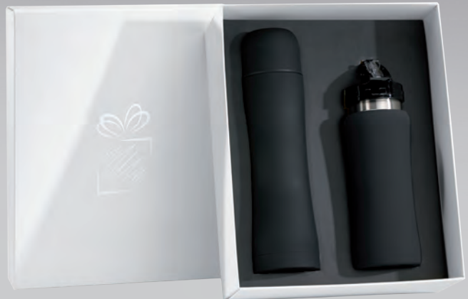
WATER BOTTLE & THERMOS SET (HB01/HT01)