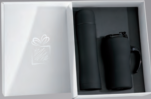
THERMAL MUG & THERMOS SET (HD01/HT01)