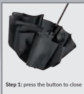
Step 1: press the button to close