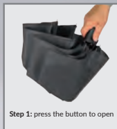
Step 1: press the button to open