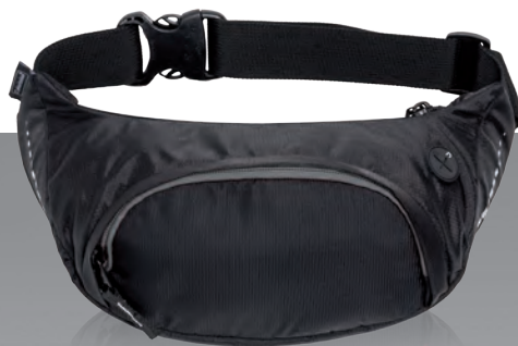
HIP BAG FLASH (LNN501)

Hip Bag from the Flash collection made of tear-resistant, very durable material. It has a capacious pocket closed with a zipper. Equipped with an adjustable strap, headphone output and air flow system on the back.