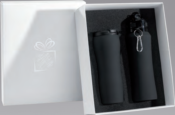
WATER BOTTLE & THERMAL MUG SET (HB02/HD02)